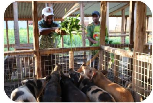
Cut & Carry