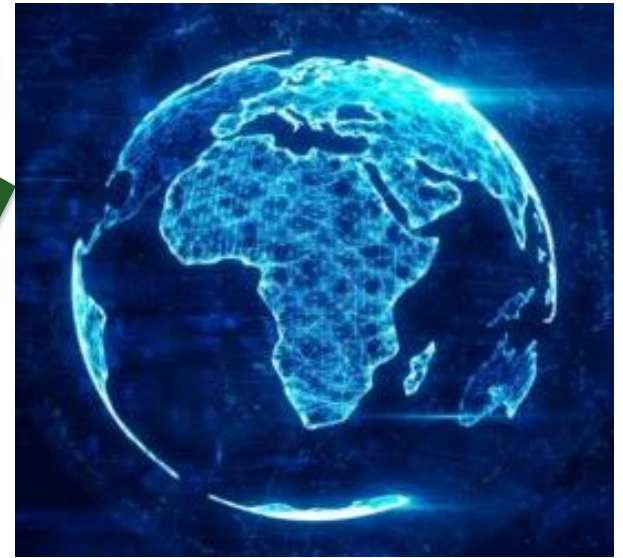
Africa 2030 and beyond

Roadmap – Technology Assessment and Technology Transfer – Technology Deployment – Create Ecosystem